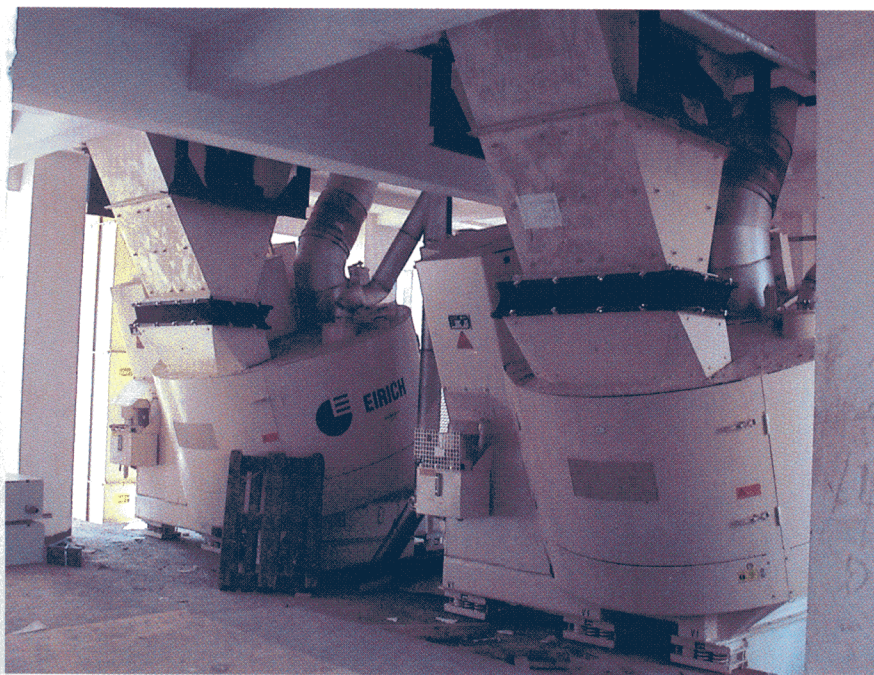
This photo was taken immediately after the installation of two Type R 24 intensive mixers at a Philips glass-making plant in China. Philips began manufacturing in China in 1984, and the company is now firmly established in the electronics market there.

The fast mixers provide "a higher level of batch homogeneity," says the project manager.