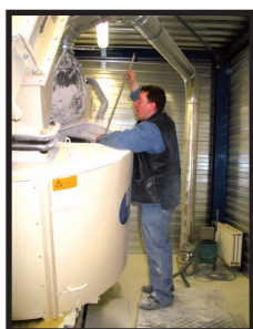
► Sampling the mixer.

Although some mixer manufacturers doubt the reliability of defining the batch homogeneity in the mixer itself (preferring sampling downstream), Philips does so because the reproducibility has shown good results with the chosen method. A significant measurable tracer as representative of the total batch is important for a reliable result and an amount of 100ppm is added to the batch. For tracer analysis in the batch, X-ray fluorescence is commonly applied. Also photo spectral analysis and acid soluble methods are in use. For the purpose of analysis, five (20ppm) samples are taken at different positions in the mixer (a series of ten samples are tested as well, however, the results are not significantly different). Samples are not taken from the batch surface layer, which means that a sample spoon with removable cover must be applied (see picture).