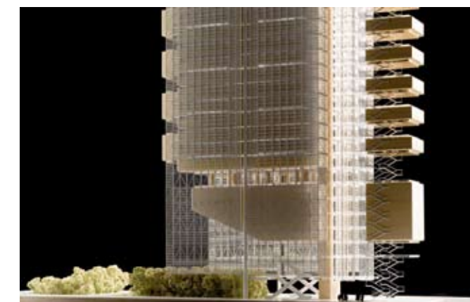
Figure 9 and 10 Lower screen and double facade of the San Paolo-Intesa Tower

the surrounding park and natural landscape.