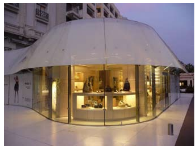
Figure 3 and 4 Facade of the Miramar palace extension.