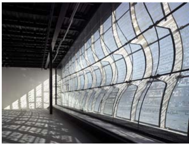
Figure 11 and 12 External and internal view of the main facade of the "Musée de la Dentelle et de la Mode"