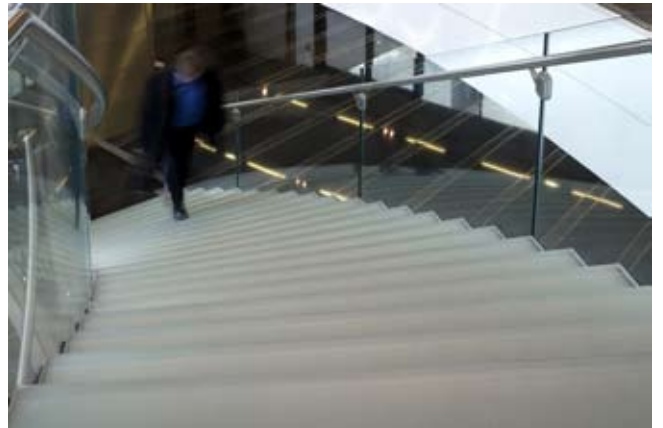
Figure 5 and 6 Glass stair in the atrium of the Bouygues Headquarters