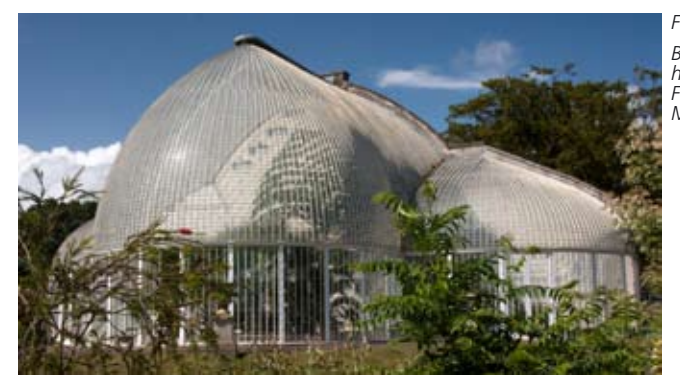
Figure 1 and 2 Bicton Garden greenhouse and Buckminster Fuller Biosphere in Montreal