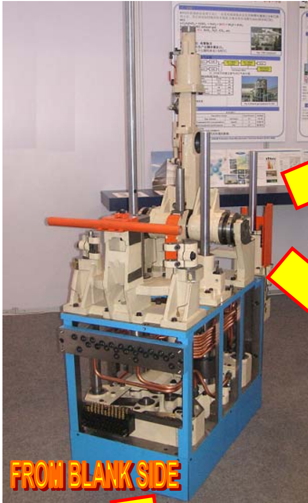
FROM BLANK SIDE