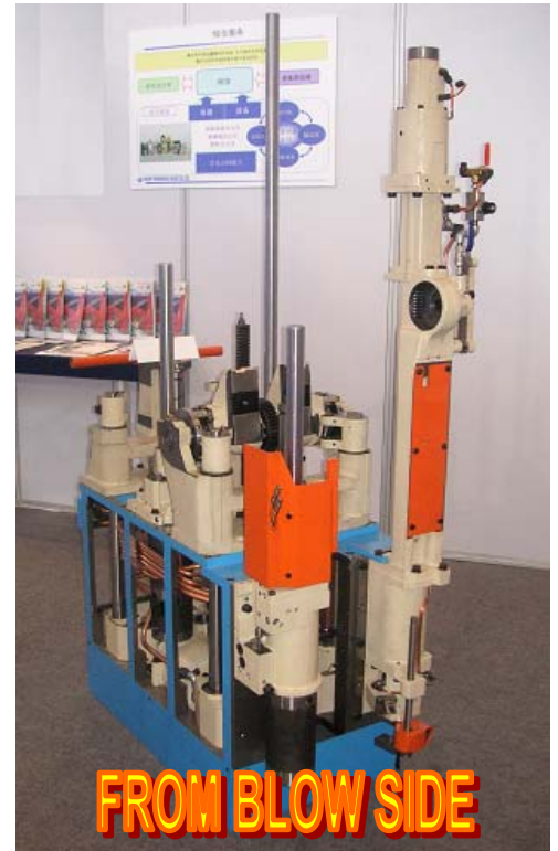
FROM BLOW SIDE