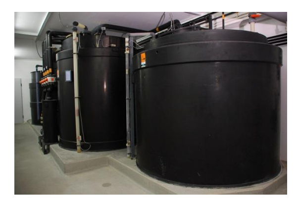
Fig. 3: Neutra chemical storage tanks

Also part of the business is to build tanks and buffer units for swimming pool technology and solar systems for over 20 years.