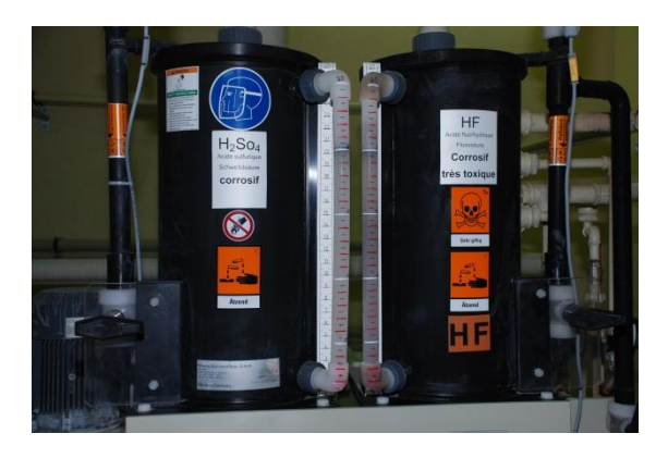
Fig. 1: CSS, Automatic chemical consumption monitoring